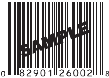
Sample 12-Digit UPC Code

For the product(s) listed below, please write-in the 12-digit UPC code from the package. You do not have to include the original UPC barcode from these products.