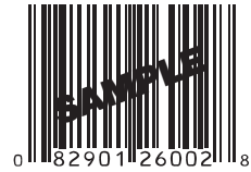
Sample 12-Digit UPC Code

If you have any questions about rebate submissions, please call 1-800-477-4137. Please allow 8 weeks for processing.