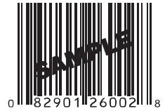
Sample 12-Digit UPC Code

If you have any questions about rebate submissions, please call 1-800-477-4137. Please allow 8 weeks for processing.